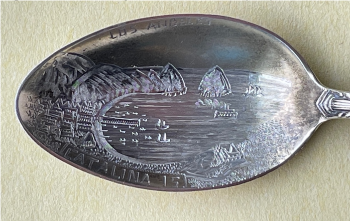
on Watson California themes enamel